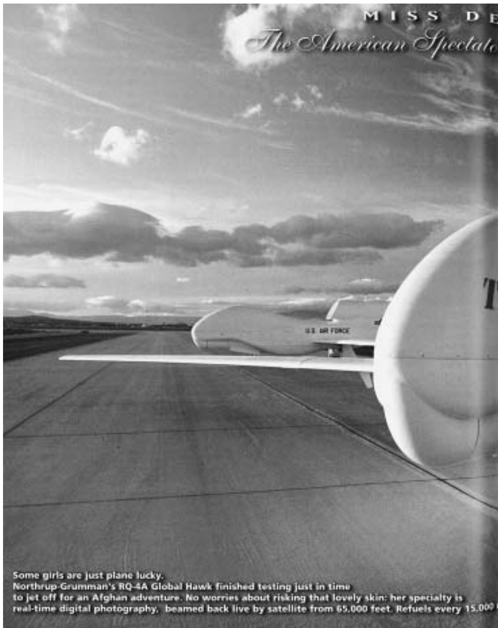
Pin-up: Miss December, 2001. Northrup-Grumman, photo manipulation by Charles Bork. Courtesy American Spectator