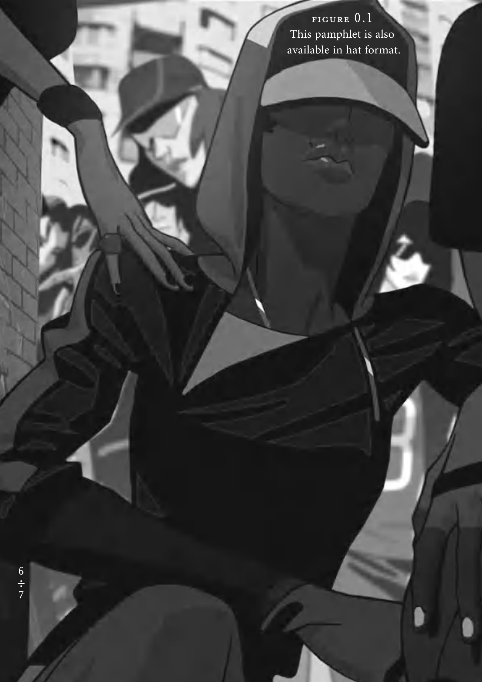
FIGURE 0.1 This pamphlet is also available in hat format.