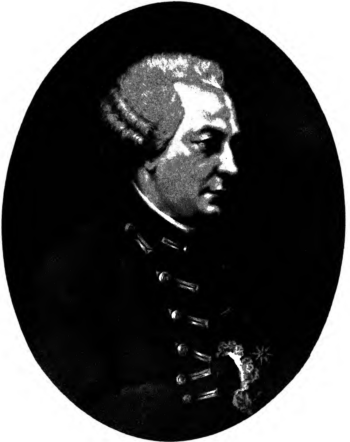
THE CHEVALIER D'ÉON. 1770.