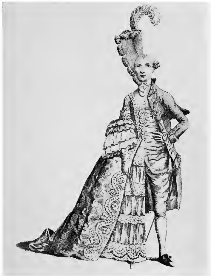
MADemoiselle de BEAUMONT, or the CHEVALIER D'EON.

Female Minister Plenipo. Capt. of Dragoons &c. &c.