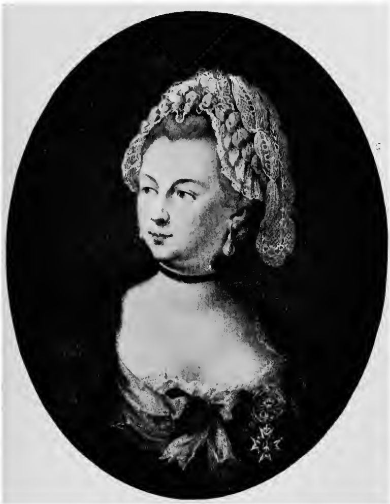
LA CHEVALIERE D'EON

From the Painting by Angelica Kaufmann after Latour