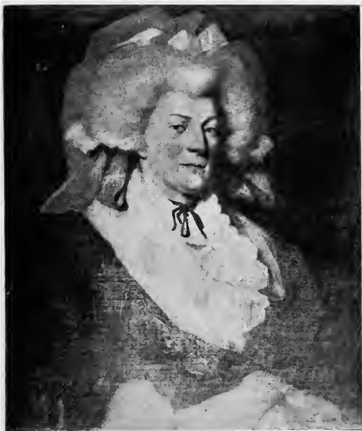
LA CHEVALIERE D'EON 1782